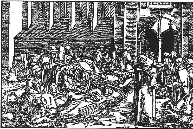
14th-century woodcut showing plague victims in front of a church

people. In this region of the world, two religions predominated, Christianity and Islam. Before we proceed to compare and contrast the responses of each faith to the plague, a basic review of Christian and Muslim beliefs is in order.