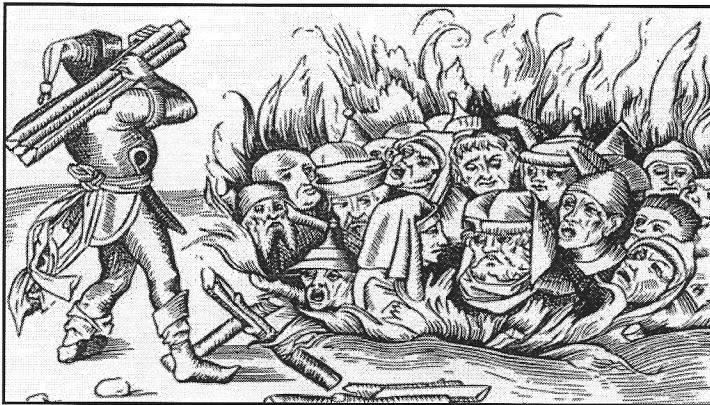
Woodcut titled "Burning of the Jews" c. 1351

And at that time, when death did rage In countries far and near, Yea, and throughout all Christenage, Of this it seemed quite clear, The Jews were guilty of this crime As all around was said, By poisoning wells at this same time, As on the rack when laid,