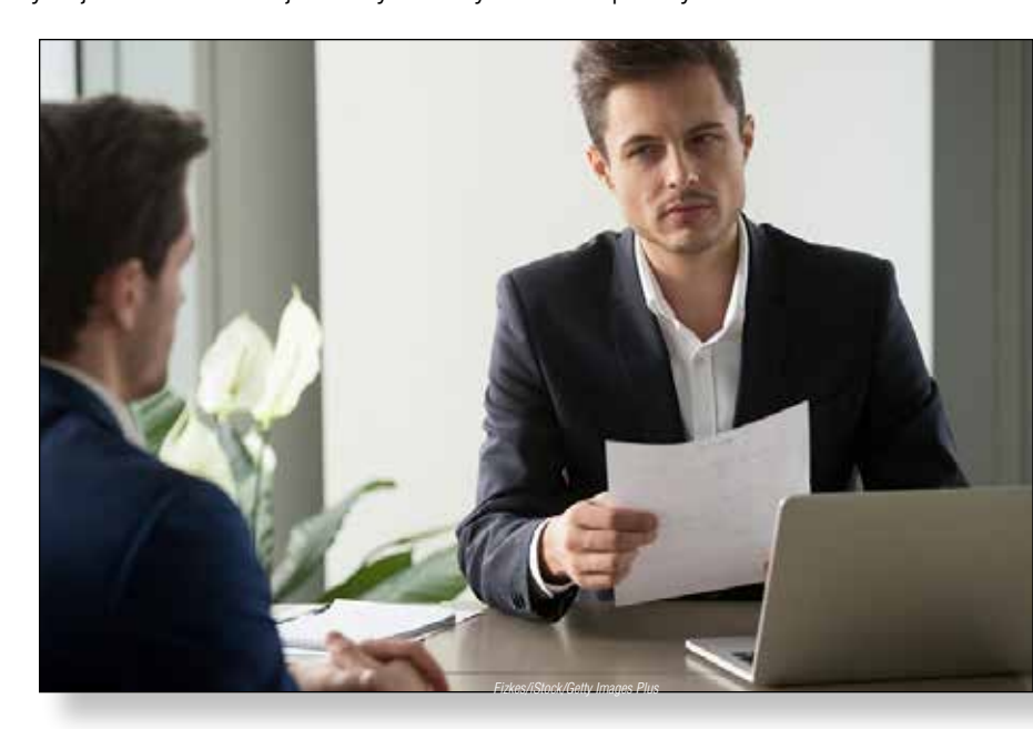
▲ The desire to prove yourself can lead to unethical behavior, such as lying to your boss or cheating on a test.

The desire to prove yourself can also lead to ethical dilemmas at school. Let's go back to the cheating example. You probably have a pretty strong desire to get good grades, do well on tests, and impress your teachers, right? For some people, that desire can push them toward unethical behavior. Your ethical principles tell you that cheating is dishonest, but if you're considering cheating to do better in class, then you're facing an ethical dilemma.