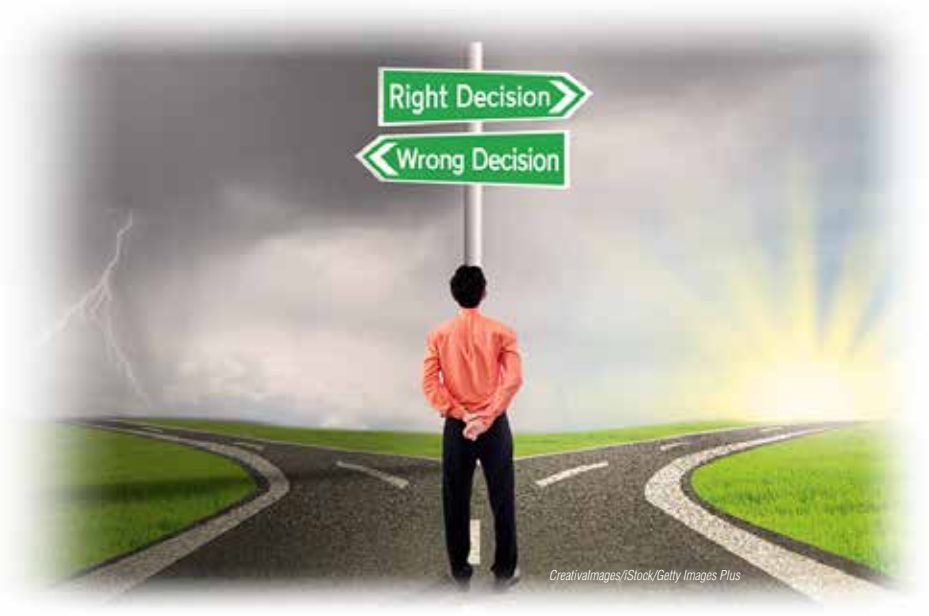
Determining the right choice in an ethical dilemma isn't always easy—after all, there aren't signposts to help guide you in making the right decision!

Take a look at these examples of ethical dilemmas and think about whether you've ever been in similar situations.