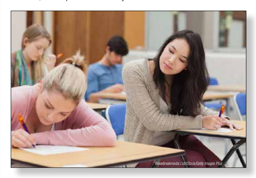
▲ Deciding whether or not to cheat off a classmate on a test is an ethical dilemma. Think about it: who could be hurt by your decision?

Have you ever had to make a decision about whether or not to cheat on a school project? Or whether you should take something that isn't yours, tell a lie, or accept credit for work you didn't do?