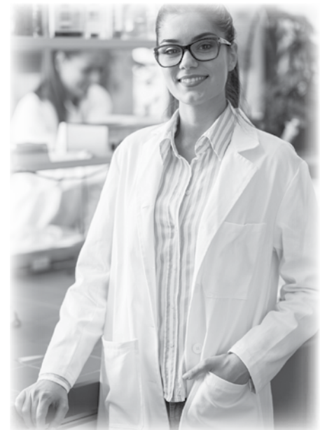
▲ If your job requires a uniform, it's still important to present a neat and polished image.