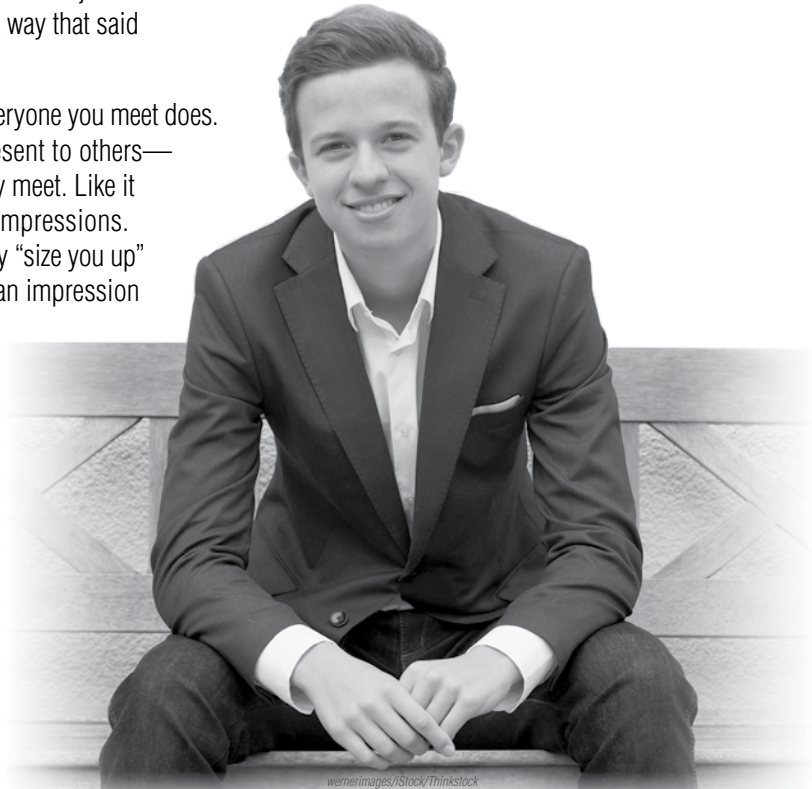
▲ When you dress well, it helps you form a good self-image and gain confidence.