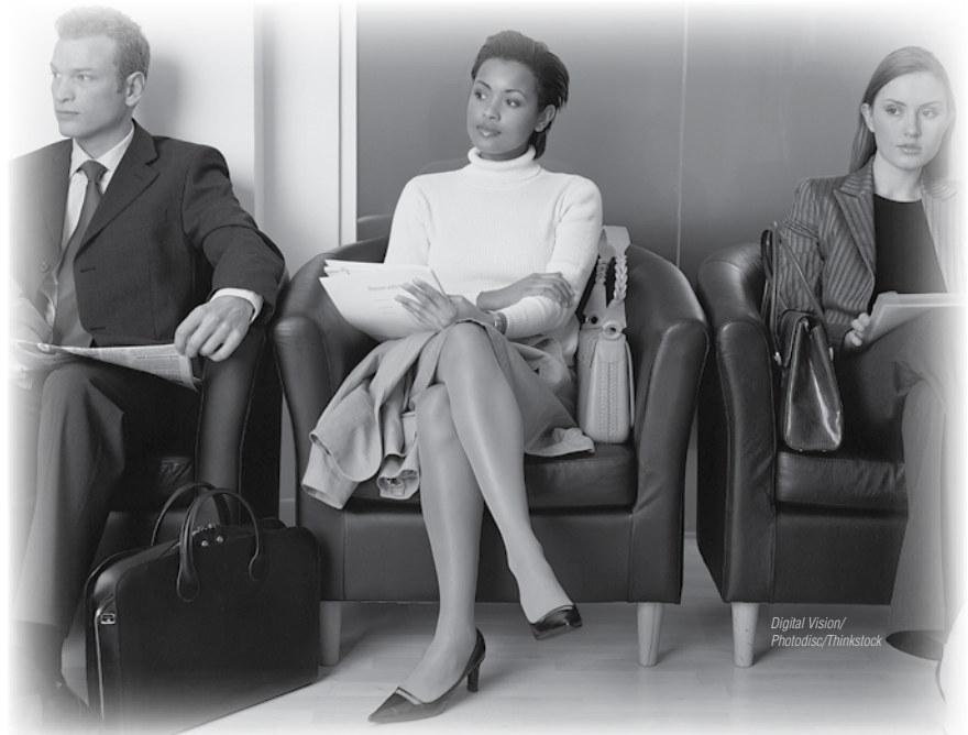
▲ Dressing well for an interview helps you make a good first impression and can set you apart from other job candidates.