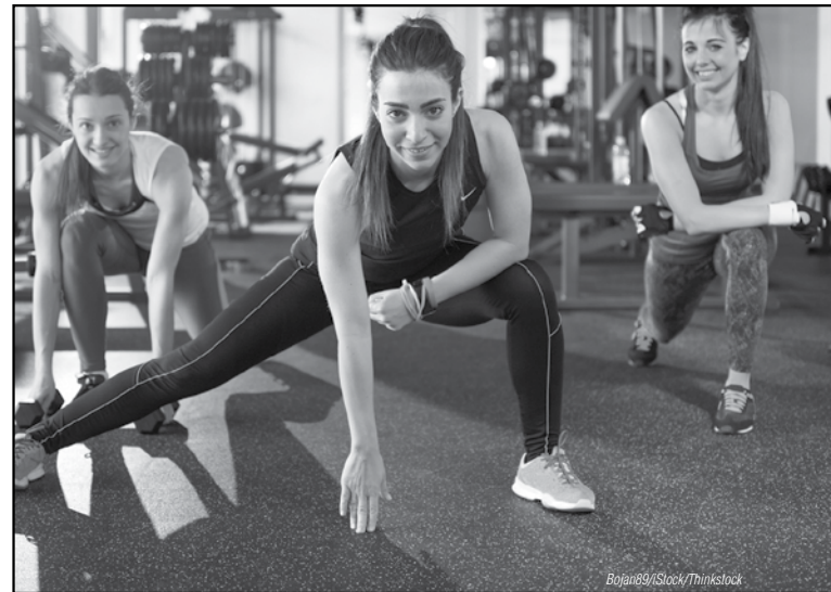
▲ Regular exercise gives you the strength and energy to deal with daily stress.

Take time for relaxation. To maintain a balanced life and good health, take time to unwind and relax. Find hobbies or other personal interests that give you pleasure—anything from sports to reading to crafts.