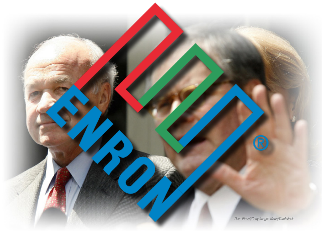
▲ In one of the most famous fraud cases in history, Enron was cited as the biggest audit failure in history in 2001. This led to bankruptcy, lawsuits, and jail time for executives.

Being unprepared for a disaster. As you know, companies must have a plan in place to keep business running smoothly in case of a disaster. Employees must be able to access the information they need. Studies have shown that around 20% of companies will experience a disaster at one time or another. Not being prepared puts the business and its clients at risk.