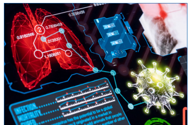
▲ A pharmaceutical company relies on various information to make informed decisions about the development and sale of drugs.

Supports decision-making. As you know, it is impossible to make the right decisions unless you have all the information you need. When a business manages information appropriately, it takes the guesswork out of many decisions. A pharmaceutical company, for example, may rely on information from market research and clinical studies to determine what types of drugs it should develop and sell. The company's decision makers will need quick and easy access to that information. Informed decisions are better decisions, and better decisions reduce a business's risk. Informed decisions also help a business keep ahead of the competition.