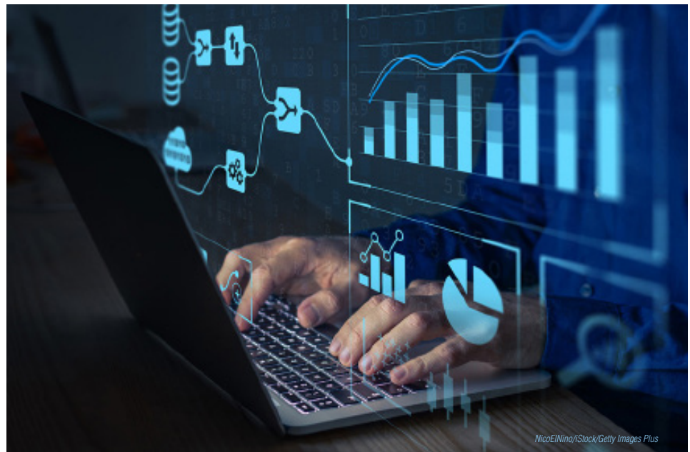
▲ Businesses must keep track of different kinds of information such as payroll, taxes, inventory, and much more!

Keep in mind that this list is not exhaustive. There may be many other types of information a business must keep track of, and different businesses will have unique categories. An auto service provider, for example, keeps track of each customer's mileage and oil change information. A nonprofit organization may manage information regarding volunteers and donors. In short, if something holds value for the organization, it is considered information and must be managed. Information can come in many different forms, including physical forms (anything on paper) and electronic forms (emails, videos, spreadsheets, social media posts, etc.).