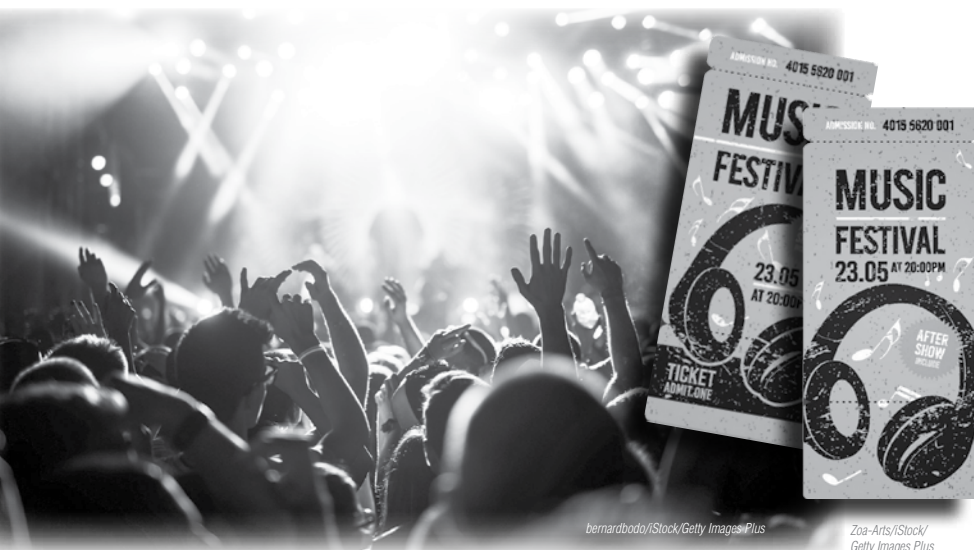
▲ As buying power increases, demand for unnecessary products such as concert tickets increases.

If consumers do not have money to spend, they cannot buy products. Therefore, buying power , the amount of money available, is a major factor affecting demand. For example, if you spend all of your income on necessities such as rent and utilities, you don't have money available to buy other, less necessary goods and services. However, if you receive a raise that gives you an extra $40 a week, you would have money to spend on other products. Your buying power would increase, and you might be able to buy the concert tickets you want (but don't need).