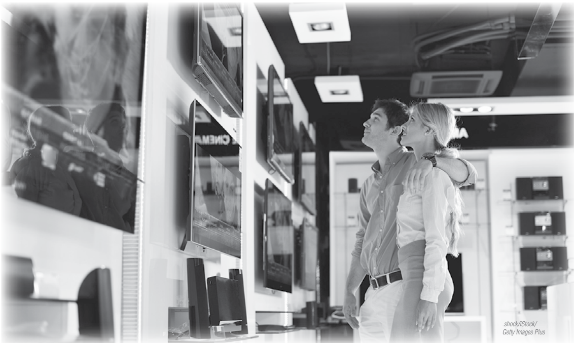
▲ As technology changes, supply of certain products rises and they are cheaper to produce, so more people can buy them.

Rolls-Royce automobiles are expensive to make, and the selling price is very high. The company produces only a few to sell to those who can afford to pay the price.