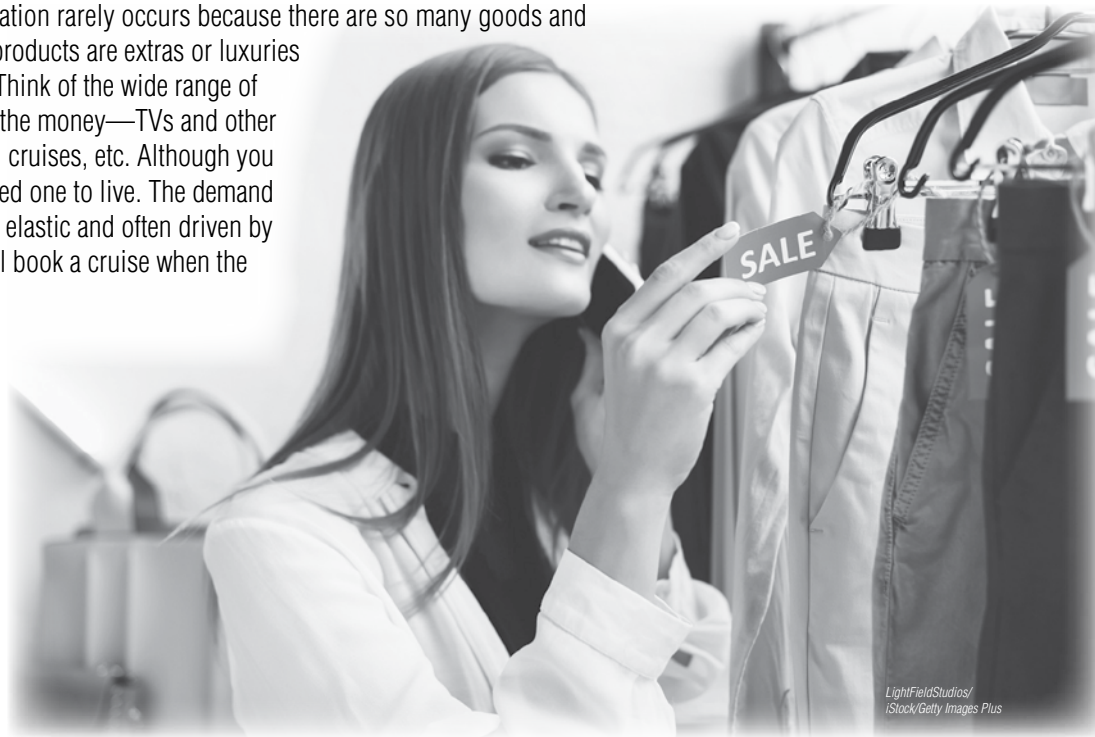
▲ When the price of a product drops, people are more inclined to buy it. This is an example of elastic demand.

Another factor that often creates elastic demand is the availability of substitute products. Let's focus on the cruise, again. Many cruise lines offer trips ranging from three days to two weeks. They also offer many different types of accommodations from an inside cabin to a suite with a balcony. If one cruise is too expensive, consumers have many other less costly ones to choose from. They can make substitutions to get the cruise that has the right price.