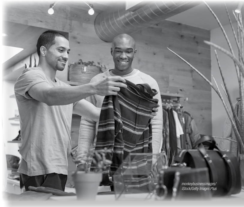
▲ Whether or not a product has utility depends on who the consumer is.

How useful consumers think some products are also depends on a person's age, gender, occupation, education, and income. For example, women have more use for cosmetics than men do. College students need to buy textbooks and supplies that other consumers do not want. Also, external influences have an effect on a person's idea of utility. Advertisements, commercials, and store displays encourage people to think they need certain products. And don't forget about peer pressure. Consumers' friends have an impact on the products they demand. (To learn more about utility, check out Use It [LAP-EC-013].)