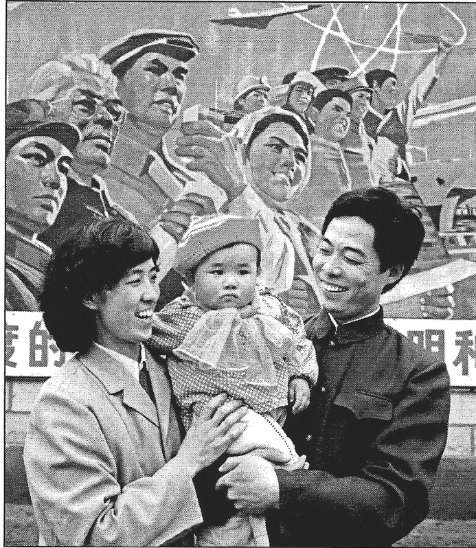
Family at Beijing Zoo.

Overview: In 1980, leaders in China feared that their nation did not have enough resources to support its huge and rapidly increasing population. To avoid what might become an overpopulation disaster, these officials implemented a far-reaching population control program called the one-child policy. The program has been revised since 1980, but after more than 30 years, it remains in place. This Mini-Q asks whether or not the one-child policy has been a good idea for China.