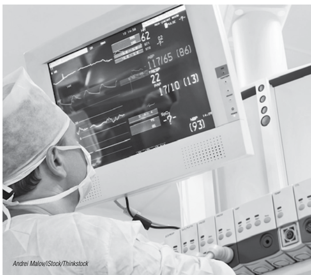
▲ A hospital buys equipment, furniture, medicine, and supplies for its own use. Without these things, it wouldn't be able to take care of its patients.

A hospital is a business that purchases many goods and services for its own use rather than resale or transformation. A hospital's purchasing specialists buy X-ray machines, dialysis machines, surgical equipment, beds, wheelchairs, scrubs, and an endless array of other items for the hospital. Without the necessary equipment, furniture, medicine, and supplies, the hospital could not properly care for or treat its patients.