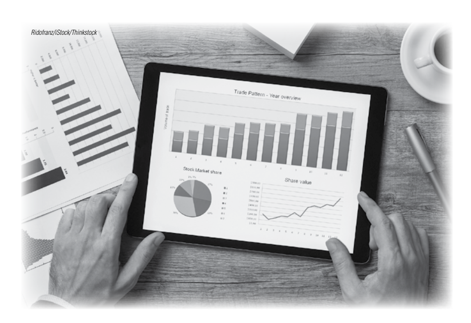
Accounting information helps businesses know where they are today and where they are going in the future.

Businesses are always looking ahead. As a result, they need accurate accounting records to plan for the future. Most businesses want to grow, expand. increase sales, and earn higher profits. To do this, they use accounting information to estimate income and expenses in the future based on income and expenses for previous years. Keeping good records will help a business allocate specific amounts to expand its market, increase its staff, enlarge its product mix, or increase its promotional efforts.