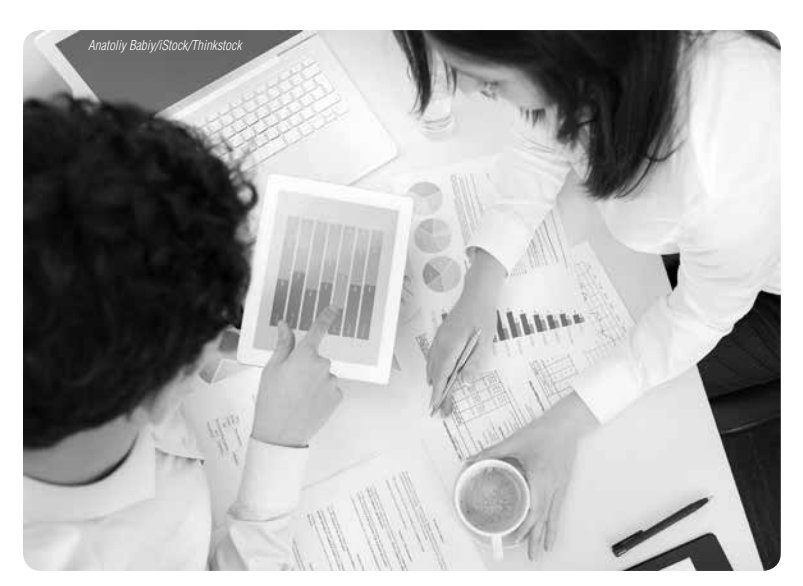
Every member of an organization should work within the same accounting system to ensure consistency and precision.

A business's accounting records show its financial health—whether the business's health is stable, improving, or declining. To provide a meaningful reading on its health status, a business must make sure that everyone involved with the records follows the same methods or procedures. In effect, a business sets up an accounting system —a consistently applied process for handling its financial information. An effective system enables the records' users to understand and accurately interpret the numbers.