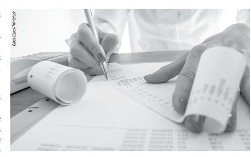
▲ All transactions must be carefully examined and analyzed.

Businesses typically use one of two accounting methods to record transactions in their journals: the cash accounting method or the accrual accounting method. The difference between the two methods is the time at which the business records transactions.