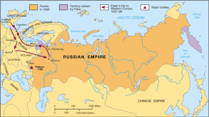
The Expansion of Russia under Peter the Great. Peter added vital territory on the Baltic Sea to the vast Russian empire.

Empire in the south to the Black Sea. He conquered East to Mongolia and the Pacific Ocean. By 1800, Russia was considered a powerful player on the world stage with an empire that covered 11 time zones (the USA currently covers 3).